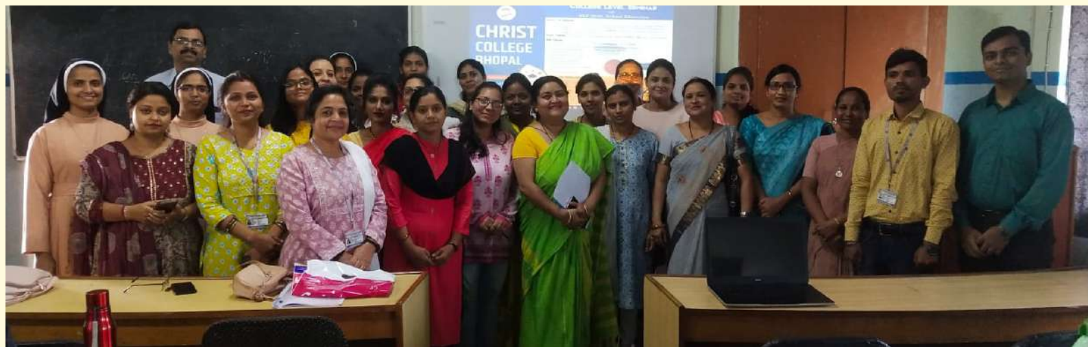
The Exuberant Participants of the Seminar