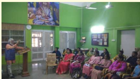
ART WORKSHOP IN PROGRESS