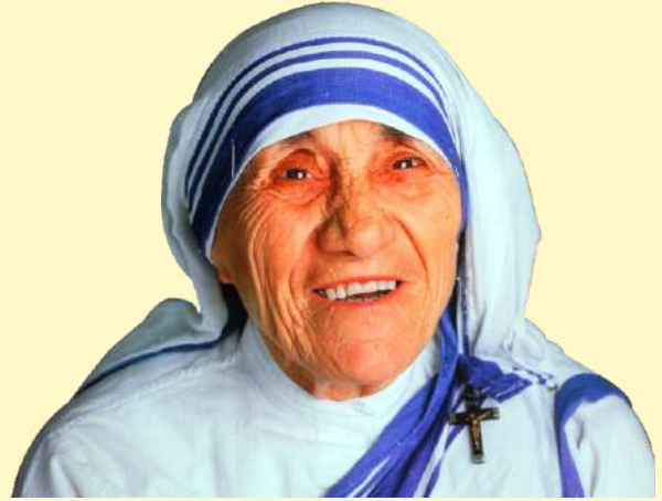
SAINT MOTHER TERESA