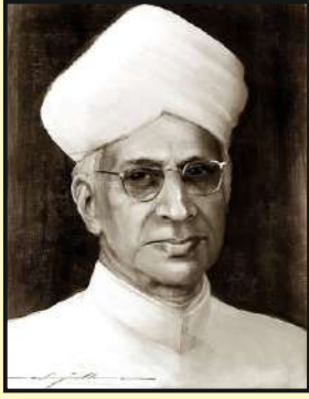
Dr. S. RADHAKRISHNAN

We pay our tributes to the Great Teacher, Statesman, Philosopher, Humanitarian and Author whose Birthday is commemorated and celebrated as Teachers' Day.